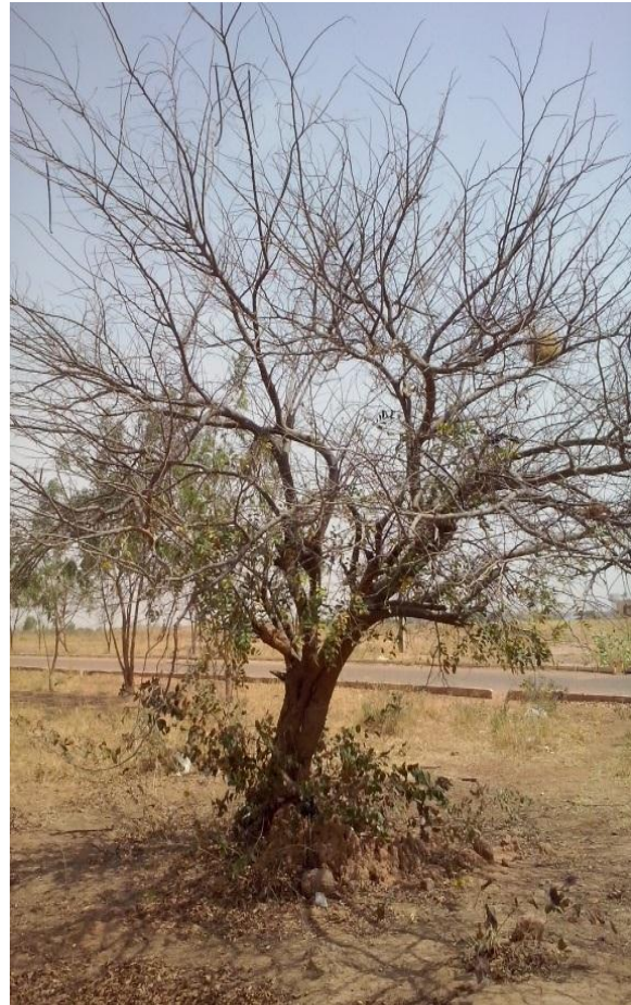
(b) Leaf shade