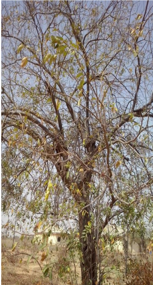
(a) Leaf shading

In tropical trees, leaf phenology is important because it reflects the influence of evolution and environment on plant characteristics, and in turn, has substantial implications for plant functioning as reported by Reich et al. , (2004). Contrary to the deciduous tree species which are generally summer flushing (vegetative bud breaks in hot dry summer, May-June). C. Sieberiana L is also a spring equinox, (March- April) in Sudan Savannah in conspecific trees.