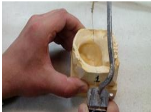
Figure 7: Split of the cast to preserve all the undercuts