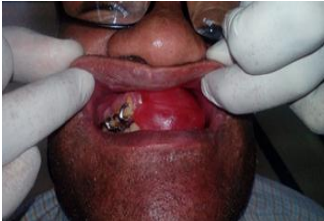
Figure 16: Jaw relation record