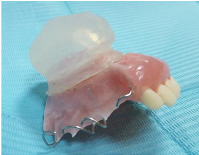
Figure 17: Silicone bulb attached by a ledge to the hollow maxillary obturator