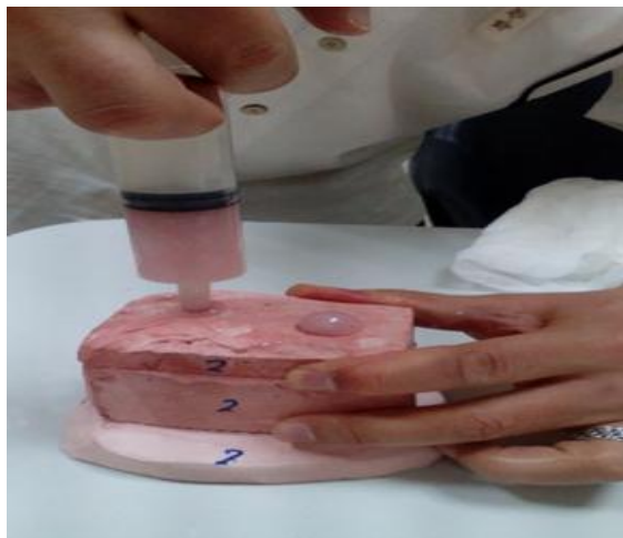
Figure 13: Packing of silicon