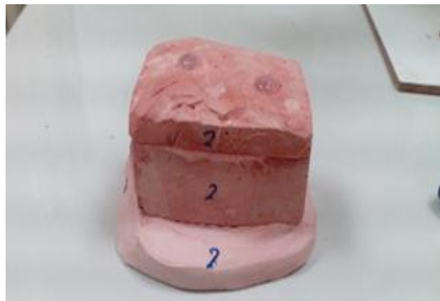
Figure 14: Packing of silicon completed