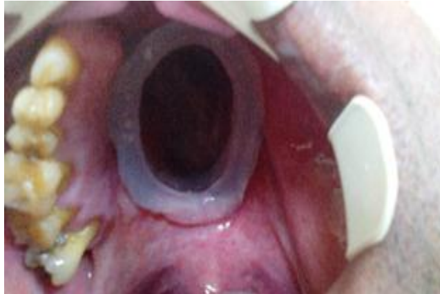
Figure 15: Delivery of the Silicone bulb in the palatal defect