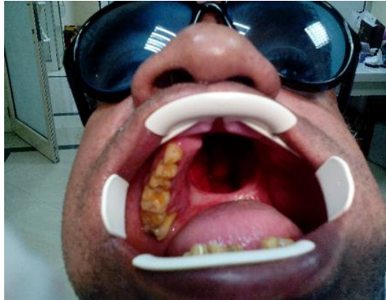
Figure 1: Class IV intraoral defect