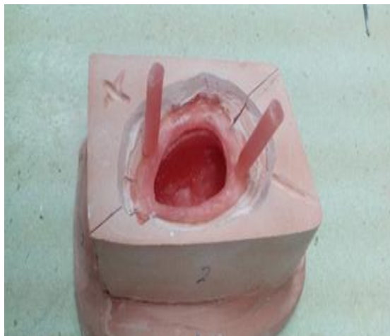
Figure 11: Two sprues were made to ensure complete packing of silicon