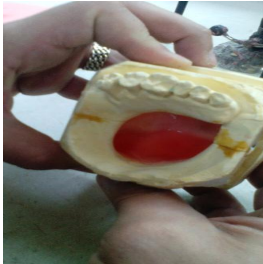
Figure 9: Waxing of the silicon bulb on the master cast