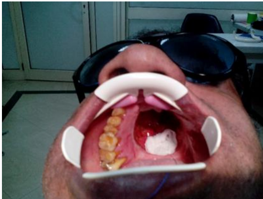
Figure 2: Blocking of the airways with vaslinized gauze