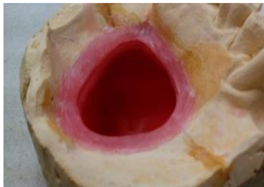
Figure 10: A ledge was made in wax for engagement of the silicon bulb to the hollow acrylic bulb of the obturator