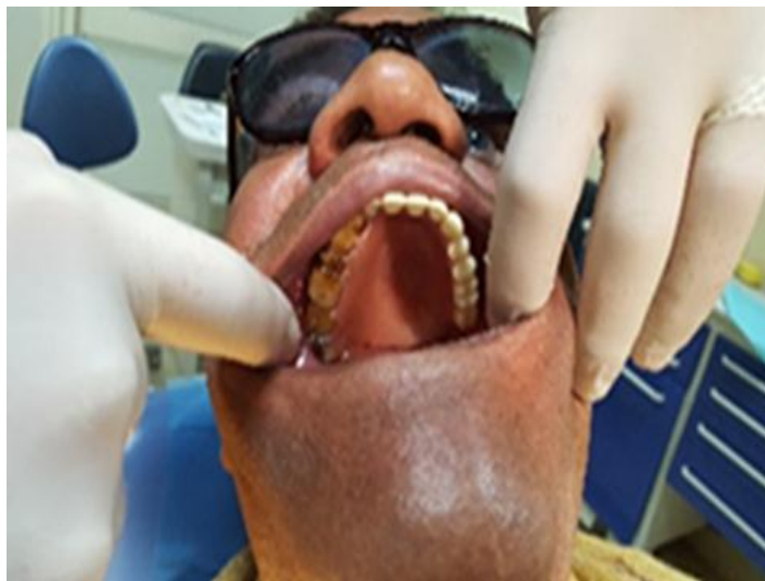
Figure 18: Delivery of the two-piece obturator