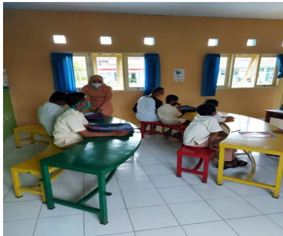
Figure 2. Strengthening educators in the learning process

The results of this study also explain that the mesatue method when examined with concern is very useful for all aspects of the senses possessed by students with disabilities. Students with various categories of disabilities can listen to this method with enthusiasm. A complete learning experience can be obtained in mesatue , namely practicing listening to stories, practicing vision, practicing memory, through the cartoon media shown. Students with mental disabilities can see pictures like reality, hear the narrative of the story so that information is obtained about knowledge, the ethical values of Hinduism, and the responsible attitude played by each character in the story. The values of religious education contained in the stories presented can be learned, lived, and applied in the daily life of children. For deaf category participants, they will be able to observe the mesatue method with the appearance of cartoon media images. The novelty of this media is equipped with sign language for moral values through moral messages conveyed in the story and also the strengthening of educators.