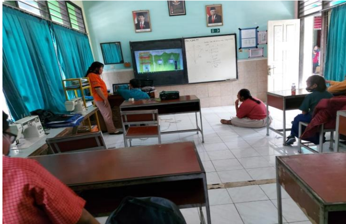
Figure 3. Media storytelling activity by a religious teacher

with various skills so that they can easily arouse the desire of children to be able to analyze problems that are found around them. Storytelling encourages children to interpret the learning process and encourages students to look at problems from the point of view of others so that they are easily digested.