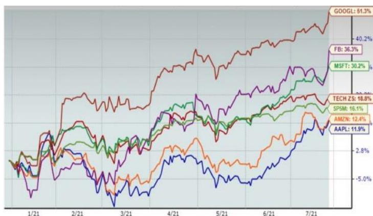
Figure 1. Price return performance of giants' tech

Heading into early 2020, the Nasdaq 100 index was rising same as GAFAM. Facebook was the first one to break lower, peaking in late January 2020. The other GAFAM stocks and the Nasdaq 100 continued to advance. Also, these giant online platforms have the biggest shares in the leading stock markets. In terms of Million Dollars' worth, Google has 685,730; Apple has 810,000, Facebook 443,700, amazon 483,000, and Microsoft 559,000. These are huge amounts of money invested in the stock market operations. Other upcoming companies would find it difficult to compete with these technological companies.